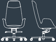
HALIA S0 EXCTV 5SB/C/HA/5TM L: 745 mm / 29.3 inch D: 709 mm / 27.9 inch H: 1143-1228 mm / 45.0-48.3 inch