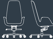
HALIA S0 YSYK MNGR 5SB/C/HA/5TM L: 745 mm / 29.3 inch D: 741 mm / 29.2 inch H: 1143-1228 mm / 45.0-48.3 inch